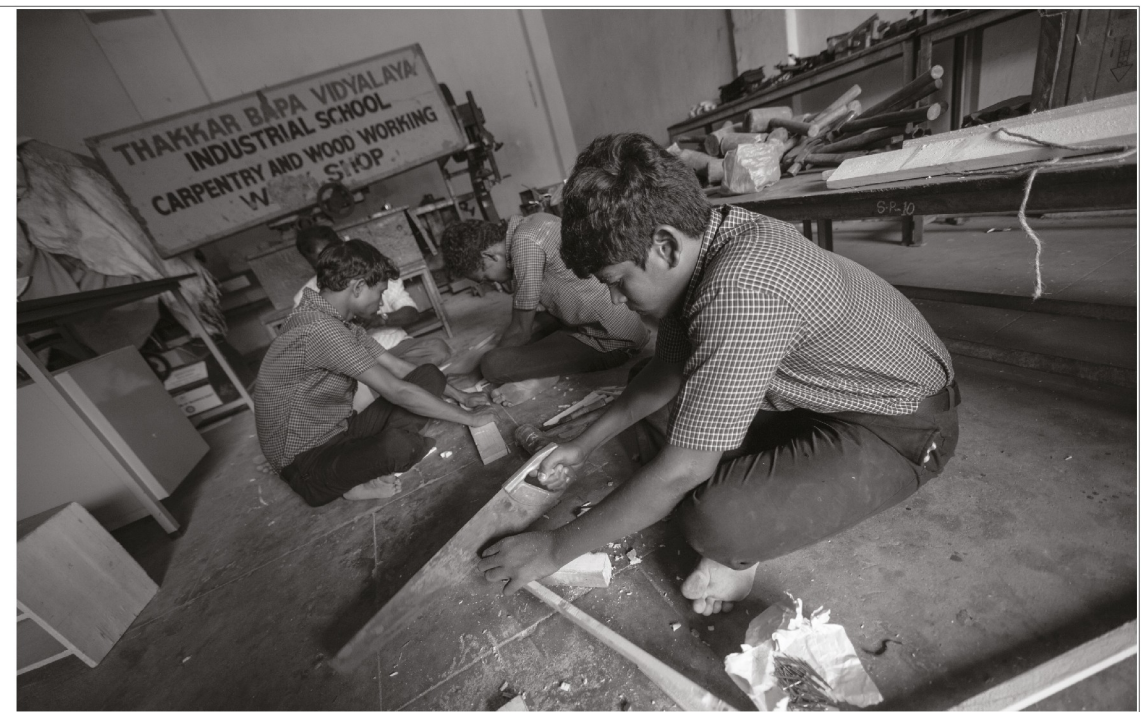
The recent floods in December 2015 when the institution was submerged in six to eight feet of water and had suffered extensive damage